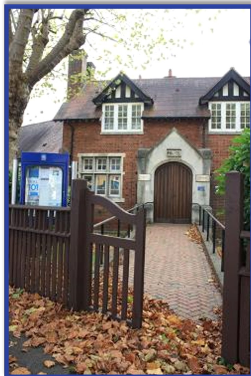
Northwood Police Station under threat again?

The office at Ruislip Police Station is manned every Friday between 1000 and 1300 – a telephone call beforehand would be welcome if a personal visit for information is preferable.