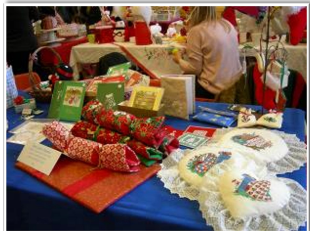
Northwood Craft Market – The Home of Handmade!

After the Christmas Market, we will be taking a break until March 2018 , when we will resume our monthly markets. For more information about the market, including future dates and photos of the crafts, do look at our website.