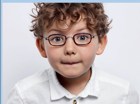
Lamertons offers a comprehensive eye test for children

Eye examinations for children under the age of 16, or 16-19 in full time education, are funded by the NHS, therefore completely free of charge.