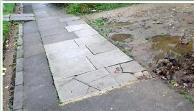
An example where new paving slabs were damaged within two weeks of being laid. Please report such incidences to NRA or LBH

If you know of an issue where a development or a home improvement is causing damage to the environment please let the council and the NRA know. We are here to help. It doesn't matter whether it is noise nuisance, a rubbish dumping nuisance or damaged pavements or driveways. If the council is informed action is usually taken.