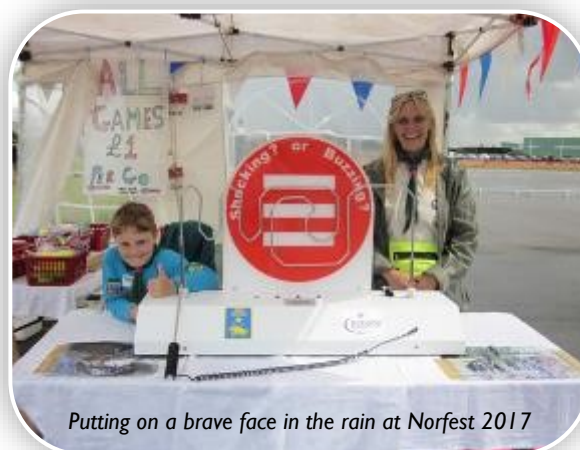
Putting on a brave face in the rain at Norfest 2017

25-year lease has been issued by the council, and is under review. We plan to start work clearing the site and demolishing the old building immediately after next year's Jumble Sale in May.