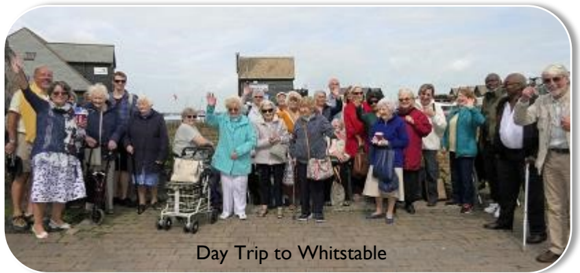
Day Trip to Whitstable

We are very happy to receive enquiries from both new volunteers and potential members. Drivers are particularly needed, but all volunteers are welcome. Anyone in the Northwood area age 60+ is eligible to become a member.