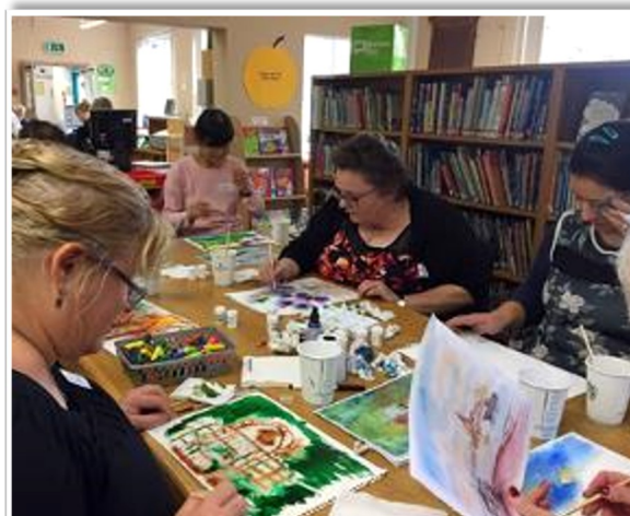
Brusho Art Group - one of many events from Hillingdon's Culture Bite Festival

DO YOU ENJOY POETRY? A new poetry appreciation group has just started at Northwood Library. Meeting on the third Thursday of every month at 2pm, we read and discuss a wide variety of poems from different poets, places and eras - sometimes funny, sometimes serious; there's plenty to talk about and something to suit all tastes. This is a relaxed and informal group and everyone is welcome.