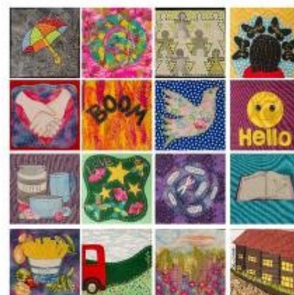
I am Me exhibit