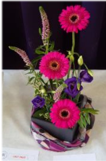
A winning entry