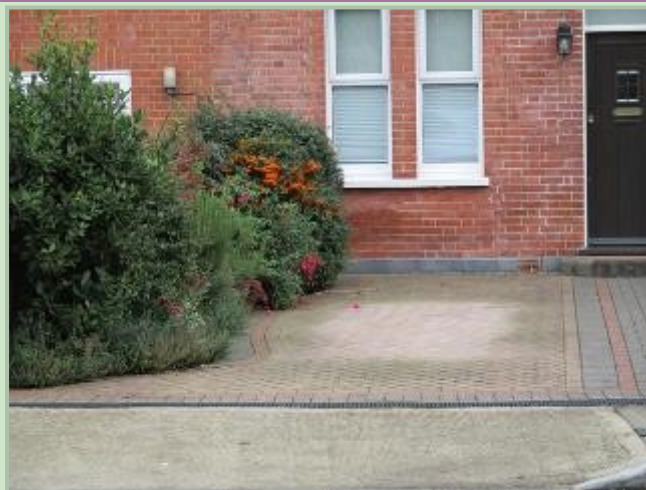
Room for a car AND some wildlife habitat

“Where hard paving allows water to run straight off the driveway and on to the road, or you pipe it straight into the sewers, this water enters the drainage system which wasn't designed to cope with the extra water. Water also takes with it pollutants and silt from drives into the roads and sewers and then our rivers. The result is that flooding and pollution has become a more common