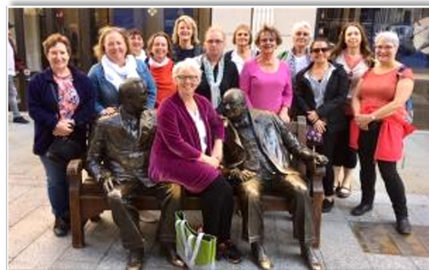
Members enjoy a London walk

Each year our members select a local charity and raise funds to assist their work. Our charity for 2019/20 is FirmFoundation , based in Harrow, which helps relieve the immediate suffering of the homeless and works with them to find practical, sustainable solutions to their needs.