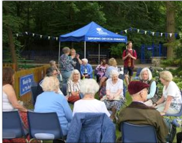
Members enjoying an outing at Ruislip Lido Railway

NORTHWOOD LIVE AT HOME has had a busy summer. The ever-popular canal boat trip with fish and chip lunch was fully subscribed and this year's seaside outing to Southend was enjoyed by all. Thanks to a generous auction prize donation many members, along with children from Frithwood and Yeading Junior Schools, had fun travelling on the Ruislip Lido railway, followed by a picnic and ice-creams on the private railway lawn.