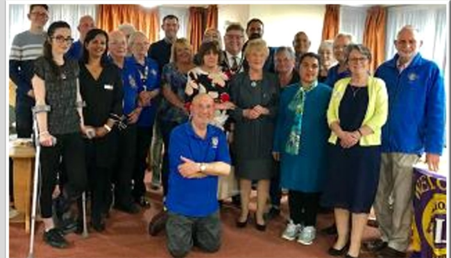
Lions and friends - one of the biannual presentation evenings