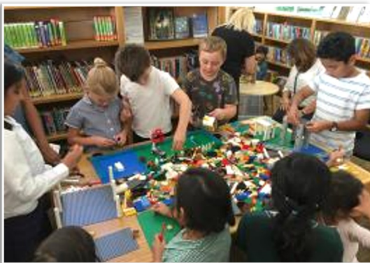
Lego - Building Libraries of the Future