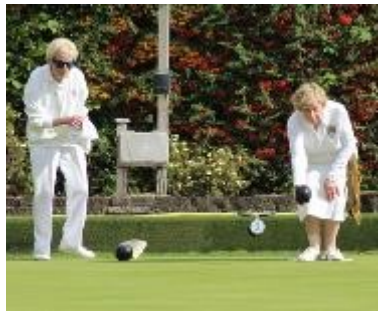
Finals days for the bowling clubs

Our outdoor bowls season runs from April, across the summer, this year until early October. Many of our members also belong to indoor bowls clubs, so the game is available all the year round and the same bowls can be used indoors and outdoors.