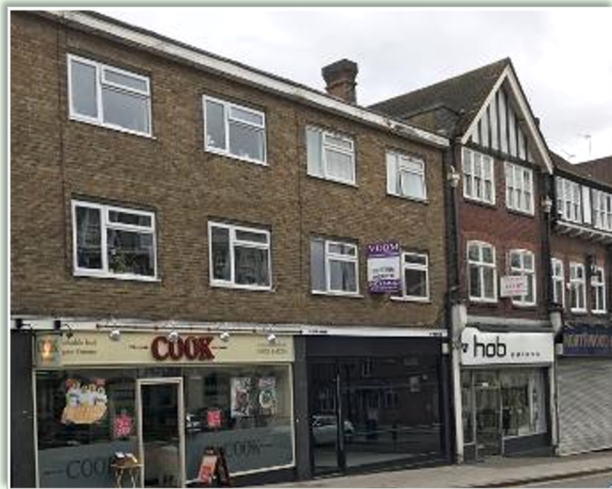
Green Lane, full occupancy by Christmas?

As the main commercial estate agent in Northwood, we have been asked to comment on the situation regarding the number of vacant shops. One can be forgiven for thinking that all is doom and gloom in Northwood but fortunately, the reality is very different. There continues to be a reasonably strong demand for shop units in Green Lane and Maxwell Road. However, what is clear is that for traditional retail uses shop buildings are not in demand and that demand is unlikely to return. However, what can be created still is a vibrant location offering a wide range of services. The demise of pure retailing has come for a number of reasons and in many respects we are all to blame by favouring buying on the internet rather than supporting local shops. On the other hand, some local shops failed to keep up with the times and disappeared.