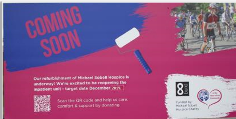
Poster on the hospice building