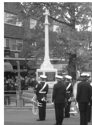
Remembrance Sunday 2008