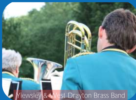
Yiewsley & West Drayton Brass Band