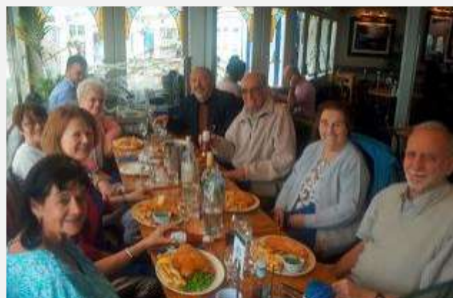
Enjoying a Fish & Chip Lunch on Brighton Pier

We now have an activity on every day of the week except Sunday. The recently introduced monthly gentle Lido walk on a Saturday with lunch afterwards is enjoyed by many. In addition to weekly Wednesday lunches, we offer a lighter soup and sandwich meal on alternate Tuesdays, now with a light-hearted singing session after the meal. Those who attend our Music for Health sessions have found them extremely helpful and enjoyable. iPad training and our two exercise classes continue to prove very popular.