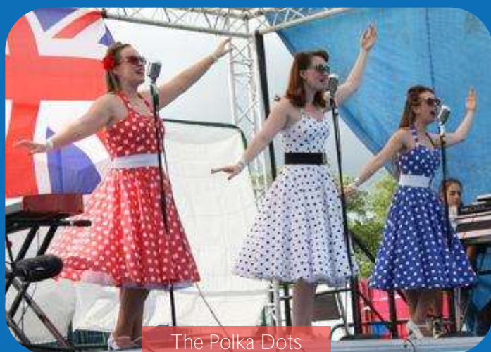
The Polka Dots

We did it! We proved that the community can join together to enjoy an open-air music event - in spite of an awful weather forecast. In the event we had a wonderful sunny afternoon. We hope that those who came to Music & Picnic in the Park enjoyed it as much as we did.