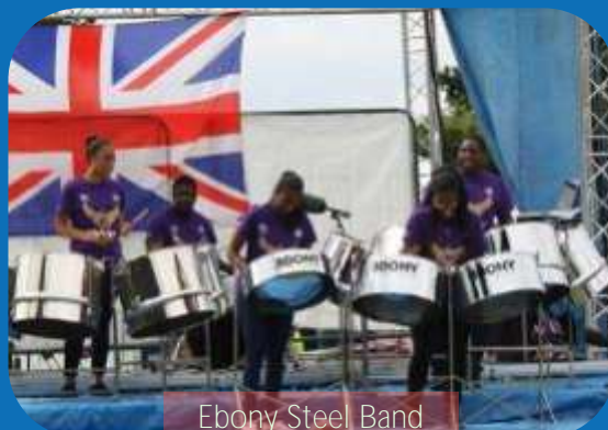
Ebony Steel Band