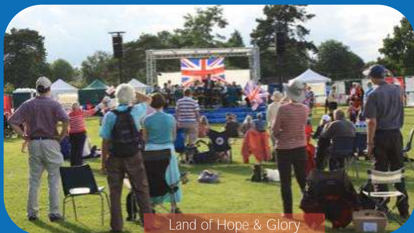
Land of Hope & Glory