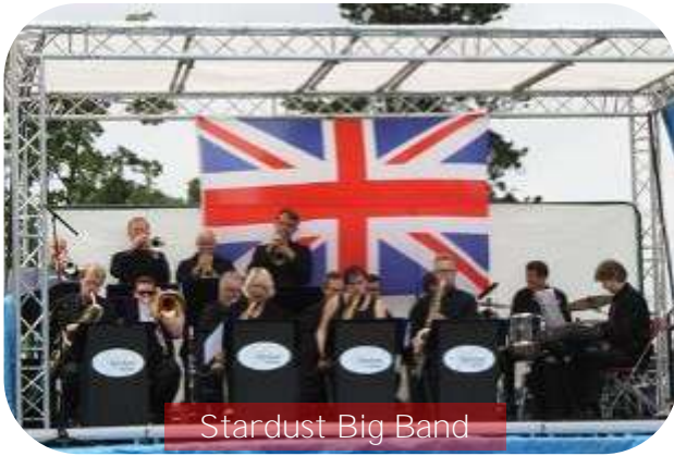
Stardust Big Band