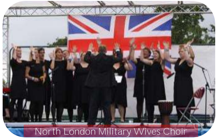
North London Military Wives Choir