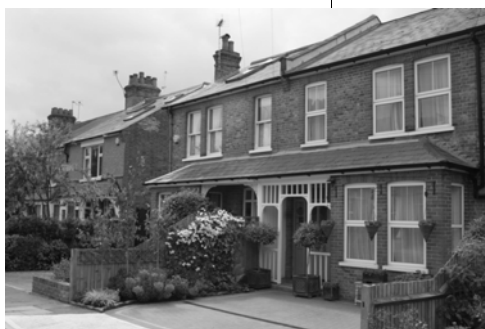
Houses in the heart of Old Northwood