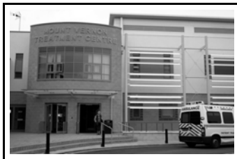
MV Treatment Centre now open

The new Treatment Centre opened on 3 rd February without much of a fanfare, the official