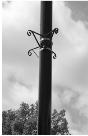
Hanging baskets coming soon

LBH has told us that it intends to install hanging baskets, and carry out other floral planting during May.