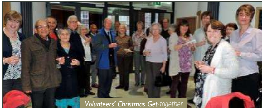
Volunteers' Christmas Get-together

In addition to Wednesday lunches, we offer a lighter soup and sandwich meal on alternate Tuesdays. Those who attend our new Music Therapy sessions have found them extremely rewarding. We are the first Live at Home Scheme to offer music therapy and would love to see more people benefit from this enjoyable experience. Another new activity, iPad