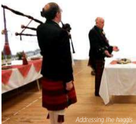
Addressing the haggis

January 24 th saw St John's host a Burns' Night, reinstating a tradition which had lapsed over the last 10 years or so. This was one of a number of events held at St John's over the past few months to fundraise for various charities. Our sincere thanks go to all who