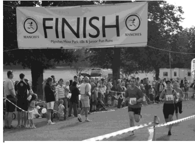
Well done number 21!

The route starts by lapping the vast playing fields, then ventures into the Moor Park Estate. The roads are closed and many residents line the route to cheer you on. The toughest part is the hills through Moor Park Golf Course, dodging balls and golf buggies but my