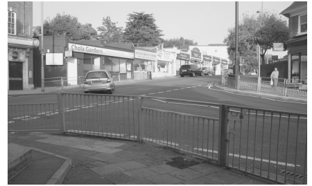
Mini-roundabout coming here soon

In addition to general aesthetic improvements, such as new kerbing and reducing the extent of the guard rails, the main changes will include the widening of footpaths adjacent to existing zebra crossings, a new pedestrian crossing on Rowland Place, a filter lane for traffic turning right off Green Lane into Hallowell Road and works to the junction at the eastern end of Rowland Place.