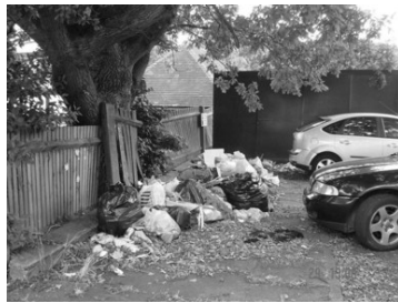
What a contrast! From floral beauty to unsightly rubbish.