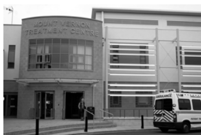
Mount Vernon Treatment Centre

Following the successful opening of the new Mount Vernon Treatment Centre, the Hillingdon Hospital Trust