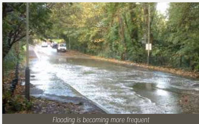
Flooding is becoming more frequent

For all information about local environmental issues, visit the council website, www.hillingdon.gov.uk and follow the links: Residents > More Services > Environmental Issues.