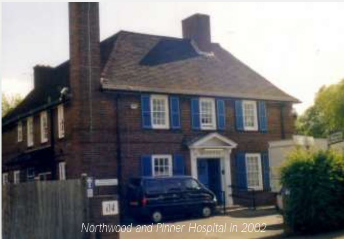
Northwood and Pinner Hospital in 2002