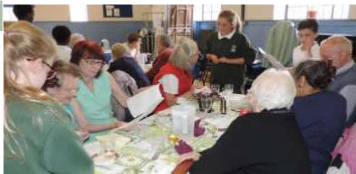
Coteford School Pupils visiting Lunch Club

New members are always welcome. We are open to anyone in Northwood and Northwood