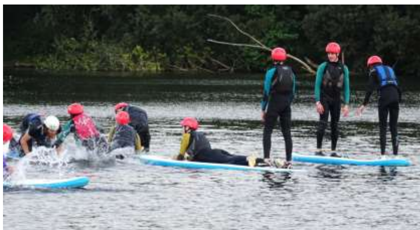
Funds raised enable Explorer Scouts to enjoy adventurous experiences

Christmas Post for Northwood, Eastcote & Ruislip.