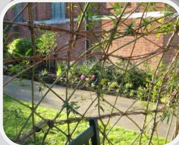
St John's transformed garden

Sunday 25 th Oct 10.30am, Harvest Festival service followed by lunch.