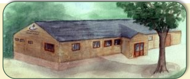
Artist's impression of the new Scouting Centre