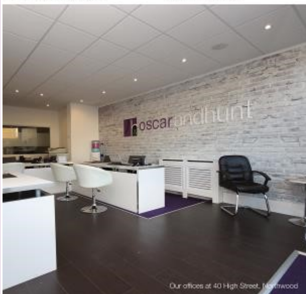
Our offices at 40 High Street, Northwood

We understand what it means to you, whatever language you speak.