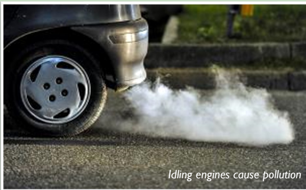
Idling engines cause pollution

Another annoyance is parents waiting in their cars with the car engine running whilst outside the college or in nearby side roads. This pollutes the atmosphere for all.