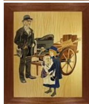
Winning exhibits by two of our members