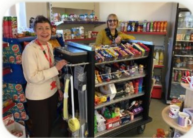
Ready for the trolley round

OUR VOLUNTEERS WORK IN SHIFTS to provide our services; we currently have 150 helpers, but always need more. The commitment could be weekly, fortnightly or monthly depending on the area you would work in and how much time you have available. If you cannot commit to a regular time, but have practical skills in publicity and advertising, we could use your expertise.