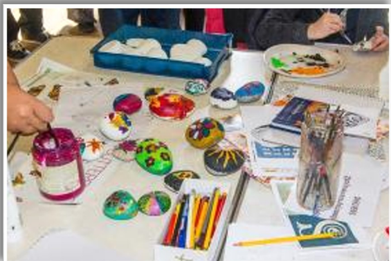
Bubbling Cauldron Activities

It's been a busy time since the last newsletter. In October, we had a Bubbling Cauldron event – nothing to do with Halloween other than being around the same time. It was an opportunity for creative juices to be stimulated and to produce some results. Painted pebbles, big knitting, face painting, storytelling and music all featured during the day.