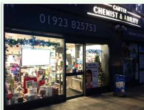
1 st prize Old Northwood – Carter Chemist. Helping to keep Northwood and other local areas mobile and on the move.