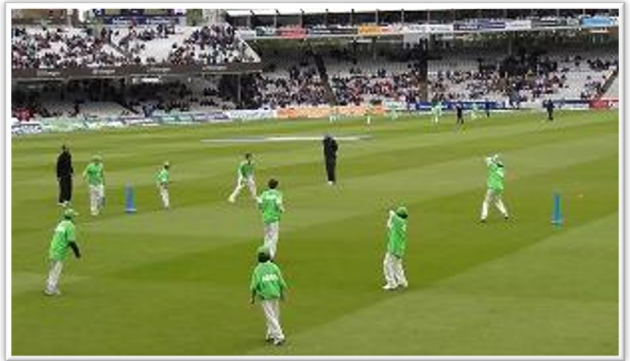
NCC Colts at Lords during Test Match lunch

Since 2012 we have had a Youth Section which now has some 125 youngsters from U7 to U15. All the young people have the opportunity to attend coaching sessions, indoors in the Spring Term and outdoors in the Summer Term. In the summer all age groups from U9 upwards play competitive cricket matches in the local area.