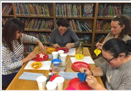
Crafty Christmas Workshop, December 2108