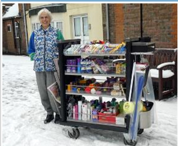
Nothing deters our Trolley volunteers!

Many of you will have visited our shops and tea bar during visits to Mount Vernon. We are now planning our services for the future and are looking for new volunteers who can commit some regular time, maybe 2 to 3 hours a week to help us. A number of our volunteers have helped us for many years and now feel the time is right to retire.