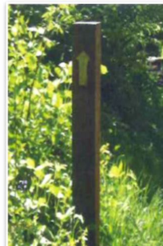
Yellow arrows show the way on the new RWT walk