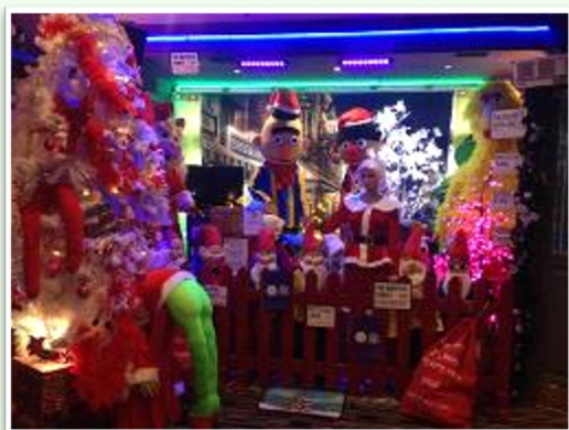
1 st prize Town Centre – The Misty Moon. A local pub with great atmosphere and good Thai Food.

Thanks to all the businesses in Northwood who helped create such a festive look to the Town Centre and High Street shopping areas. The judges had some difficult decisions to make as there were so many brilliant contenders. After much discussion, the final selection was: