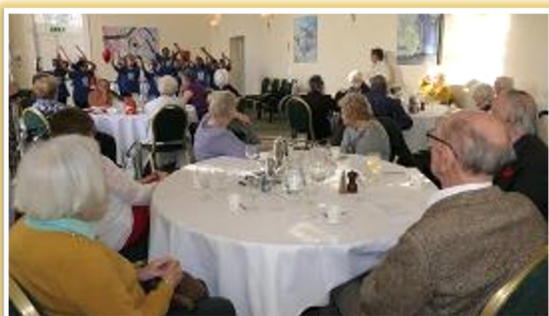
Yeading School entertaining members at the New Year Lunch

Scheme members have enjoyed a series of Christmas activities as well as a New Year Lunch held in Moor Park's Orangery. Pupils from Frithwood School came to entertain us with seasonal songs at our Christmas Lunch and Yeading School pupils sang and danced after the New Year's celebration meal. The Scheme was grateful to receive a large number of harvest gifts from Eastbury Farm and Frithwood Schools and Chickywicks Nursery, which brought much joy to the recipients. Northwood College students continue to visit Lunch Club to chat with our members after the meal. Northwood Live at Home very much values the excellent relationship it has with many local schools to the benefit of all.