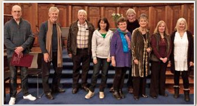
Drama Show Group. 9th February 2019

One of the last events with the pews in situ was the first community DRAMA SHOWCASE held on 9th February in the