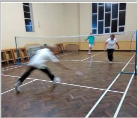
Action shot from the Badminton group