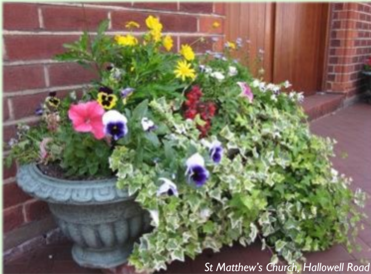
St Matthew's Church, Hallowell Road