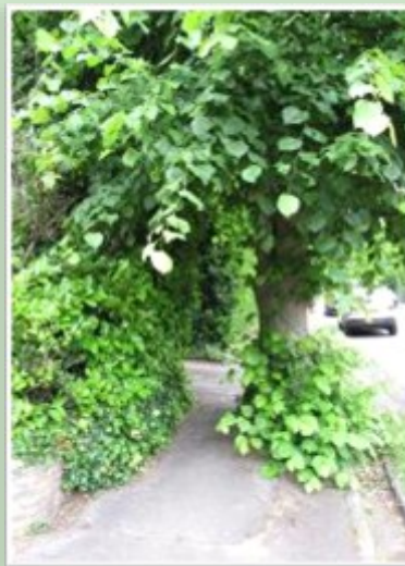
Our leafy suburb, but not much room for pedestrians

For all information about local environmental issues, visit the council website, www.hillingdon.gov.uk and follow the links: Residents > Environmental Issues. Email: contactcentre1@hillingdon.gov.uk Tel: 01895 556000