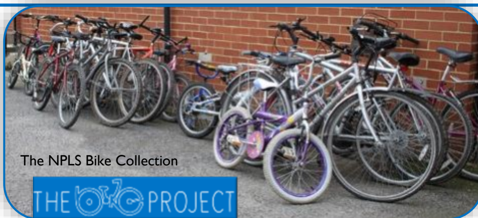
The NPLS Bike Collection

Telephone: 01923 829166 Website: www.urcnorthwood.org Email: stjohnsnorthwood@btconnect.com