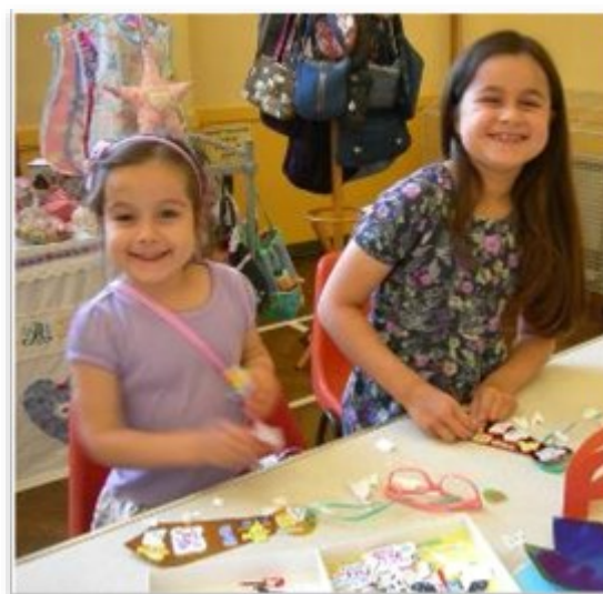
Hands-on crafts are always popular

The Plant Stall is very popular and the ladies who run it are not only raising cuttings and seedlings for sale but also enjoy answering your questions and discussing all things garden related. We are keen to encourage children in crafting and always have some hands-on crafts for them to make something to take home. Some have become regular visitors to the Market and come straight to the craft tables to see what we have for them to make.