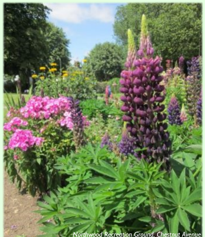
Northwood Recreation Ground, Chestnut Avenue