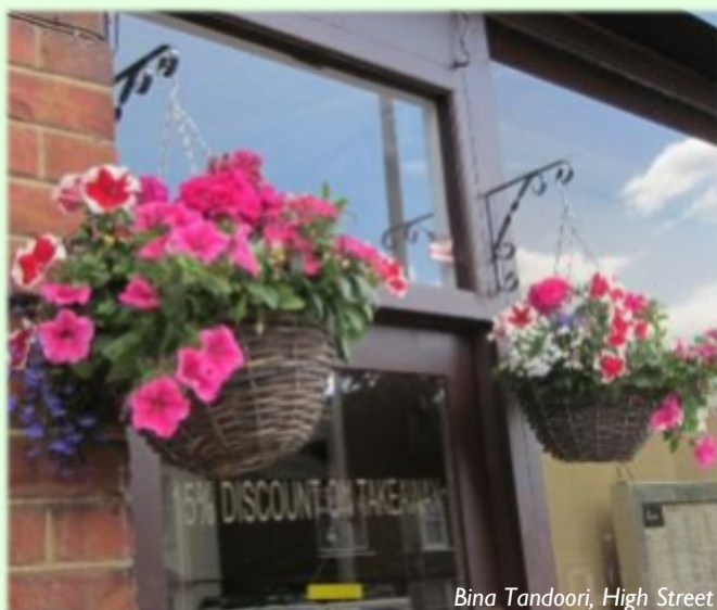
Bina Tandoori, High Street

Thank you to local businesses, places of worship and Hillingdon Council for making Northwood blooming lovely this summer!