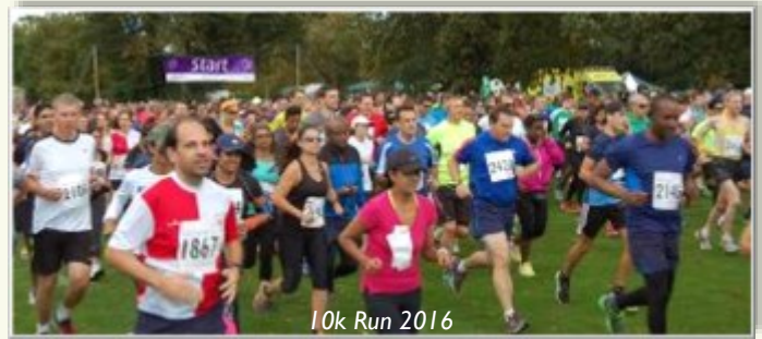
10k Run 2016

Further information and details of how to enter can be found at www.moorpark10k.org.uk .