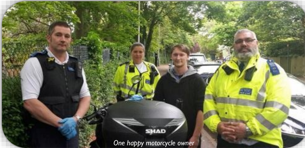
One happy motorcycle owner