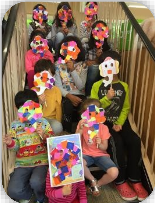
Elmer Day! Northwood children created masks inspired by David McKee's patchwork elephant.

SUMMER READING CHALLENGE 2017 launches on 8 th July and this year's theme is "Animal Agents". Children aged 4-11 years are invited to visit Northwood Library to join the challenge and collect their detective folder. Prizes, stickers and Starborg cards can be collected each time a child visits the library to borrow a book and if they manage six visits they will receive a medal and certificate. We also have lots of events planned for children. Please visit our website or ask at the library for more details.