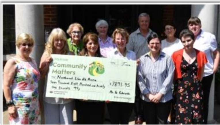
Waitrose Coordinators with a number of volunteers, members and Scheme staff