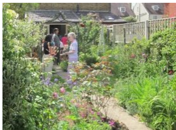
Of course it was worth the effort!

Please support other gardeners who open their gardens for charity as a lot of work goes in to prepare for the day.