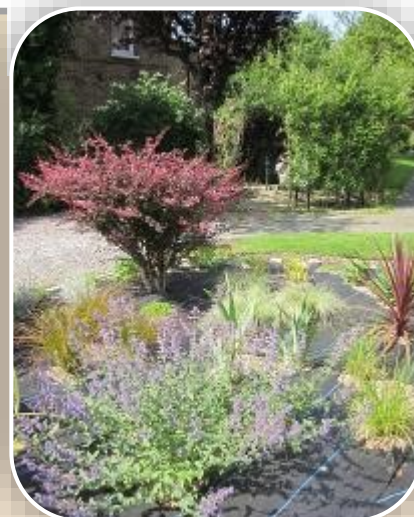
The gardens are establishing well.

All are welcome to attend any of these events. Keep an eye on our website and noticeboards for more information. We look forward to seeing you around.