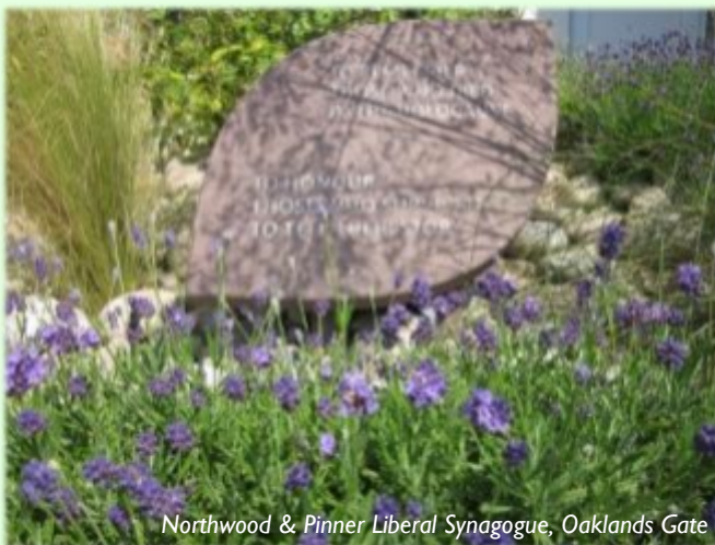
Northwood & Pinner Liberal Synagogue, Oaklands Gate

Thank you to local businesses, places of worship and Hillingdon Council for making Northwood blooming lovely this summer!