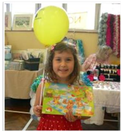
There are always hands-on activities for children

There's always a friendly atmosphere, so do call in and see us.