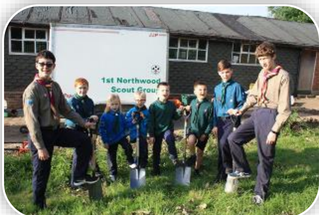
Beavers, Cubs, Scouts & Explorers try their hand at digging foundations!

Demolition started on Monday 11 th June, and construction of the foundations for the new Scouting Centre starts on Monday 25 th June. We plan to be putting the new hut on the foundations in the autumn.