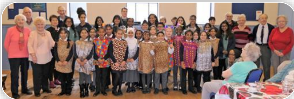
Pupils of Yeading Junior School, Northwood College Girls, Members & Volunteers

TRIPS TO THE SEASIDE. The annual seaside holiday to Eastbourne in March was again a great success, allowing those who would otherwise find it difficult to travel to experience a change of scene in safety with good and caring company. Members are looking forward to a day trip to Margate in early September. The cost of the coach for this is kindly being met by a donation from the Northwood Residents' Association.