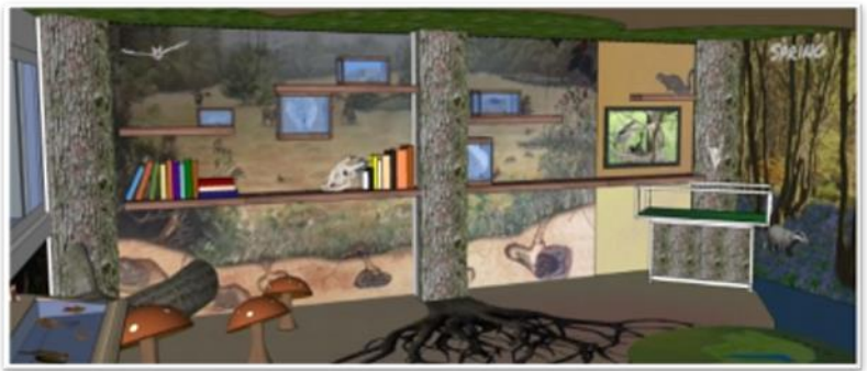
One of the design proposals for the interior of the Woodland Centre at Ruislip Lido

In conjunction with the Ruislip Woods Trust, the Ancient Woodland project's aim is to equip the ground floor of the Woodland Centre at Ruislip Lido with passive and interactive interpretation materials that describe ancient woodlands and the fauna and flora found within them. The focus will be on the Ruislip Woods National Nature Reserve.