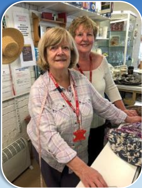
Two of our lovely volunteers serving in the Look-In shop

This year we celebrate 70 years since the establishment of the NHS but by 1948 the Comforts Fund had been raising funds at Mount Vernon for over 13 years. We were established in order to provide finance to help wards and departments purchase those items which would improve patient comfort. In the early days this was mainly chairs, blankets, baby clothes for the children's ward and items to improve care for the elderly. More recently we have seen the need for new equipment and have financed the purchase of hi-tech equipment for the liver unit costing £60,000 and a range of other requests from physiotherapy, especially from Daniels Ward, where patients with brain injuries are rehabilitated. We have also contributed to a new call system in the Cancer Centre.