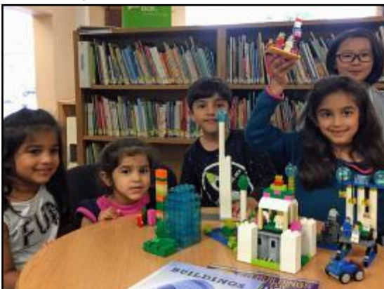
Build the Future, a recent children's event at Northwood

The Summer Reading Challenge 2018 launches on 7th July! This year's challenge is called Mischief Makers and celebrates 80 years of The Beano. Children aged 4-11 years are invited to visit Northwood Library during the holidays to join the challenge. They will be able to collect prizes, stickers and Starborg cards each time they visit the library to borrow a book and if they manage 6 visits they will receive a medal and certificate. This can be any book including joke books, fiction, non-fiction, graphic novels and talking books. We also have lots of events planned for children. Please visit our website or ask at the library for more details.