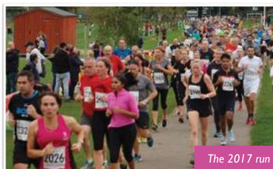
The 2017 run