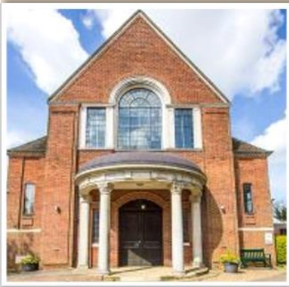
St John's URC, Hallowell Road

It's worth keeping an eye on www.hillingdonarts.org.uk and the church noticeboards for info of what is happening at St John's.