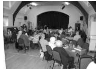
Lunch Club at St. John's church