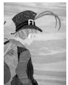
Examples of recent work by members.

The Harrow Marquetry Group meets on Friday evenings in The Church Hall, Hatch End Free Church, Corner of Rowlands Avenue & Uxbridge Road, Hatch End 7.30 - 10.00pm.