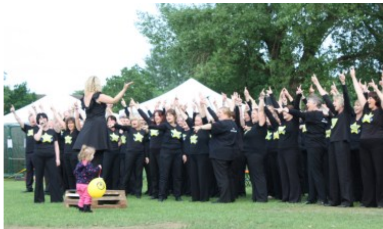
Great finale from the Rock Choir

A lady at the far end of Hallowell Road said she could hear the National Anthem from her garden.