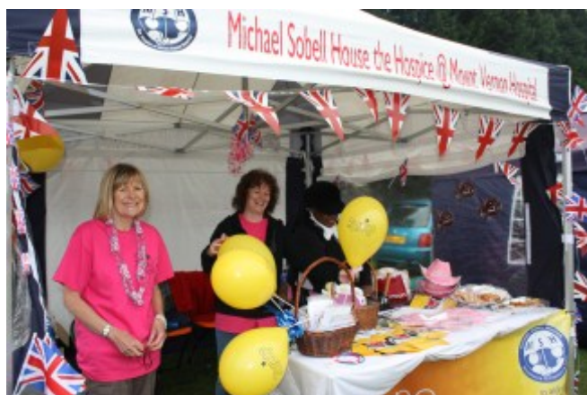
Friends of Michael Sobell Hospice

52 adults plus 20 Explorer Scouts helped on the day