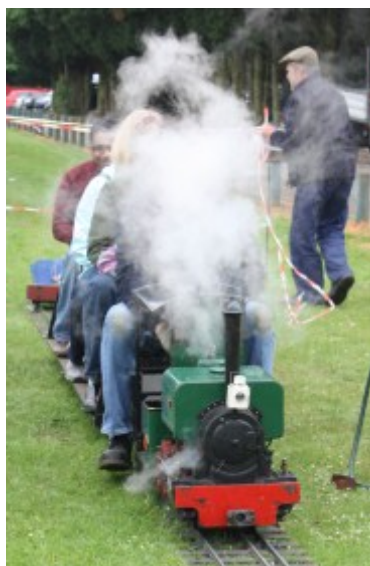
Harrow & Wembley Model Engineers steamed away all day