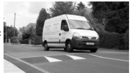
Calming tables not fit for purpose?

Kewferry and Moor Park Roads which are not able to cope with the traffic loads they are subjected to and are constantly breaking up. This is good news for the contractors repairing them but not such good news for local taxpayers! If your street has been identified for traffic calming please let the NRA know so that we can help with selecting the preferred system.