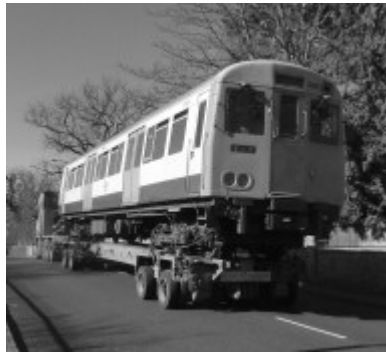
An A stock carriage on its way to the recycling yard in the North of England

The new S stock in particular continues to have “teething” problems. This particularly applies to the PA system, which sometimes breaks up, rendering announcements unintelligible, or gives out the wrong information. Strap hangers have been ordered because of complaints that the horizontal bars are too high for many people. Three new S stock trains are being delivered every two weeks. A float of old A stock will be kept for a while, but it is envisaged that the entire old stock will have been replaced by September.