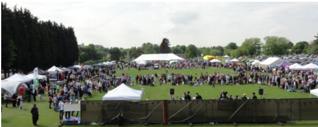
View from the clubhouse roof

£637 collected in the bucket-shake for the Northwood Live at Home Scheme at the two entrances.