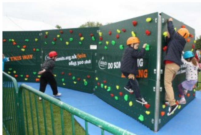
District Scouts' brand new traversing wall was popular

Thank you all - organisers, helpers, stallholders, entertainers and attendees - for taking part in such a memorable day.