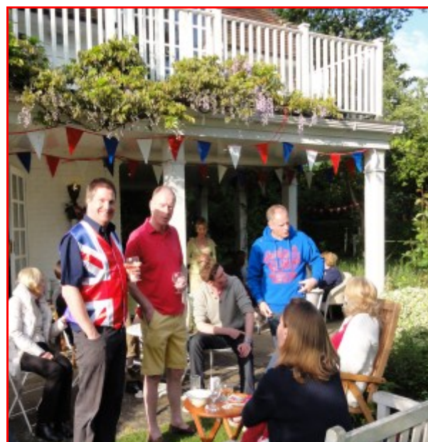
Hills Lane residents partied at The Coach House