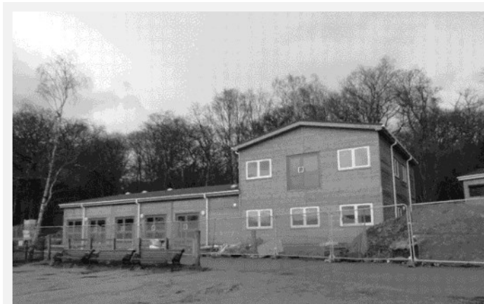
New café (on left) with Woodlands Centre and classroom above