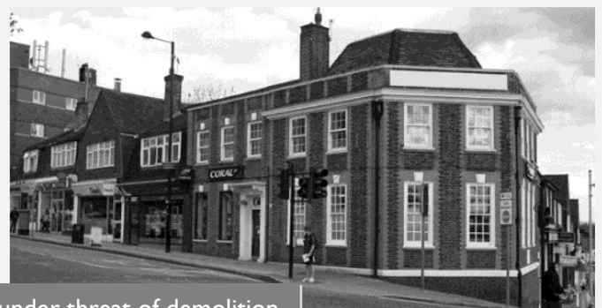
These businesses and flats are under threat of demolition