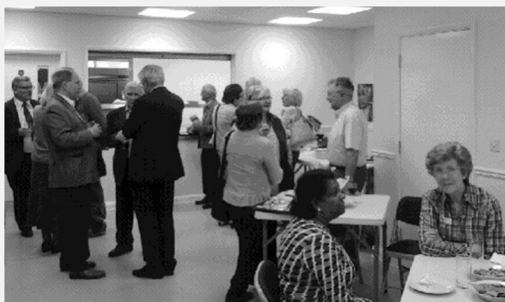
Road stewards enjoy animated discussion at their annual get-together

The timing of the reception was fortuitous in that it coincided with the launch of the NRA working party whose purpose is to plan the campaign to oppose the TfL development of Station Approach. A short introduction by Tony was followed by a 30 minute debate!