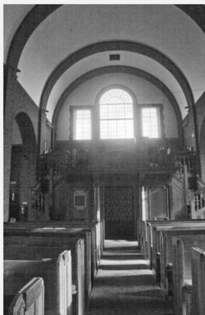
Before the redevelopment ....

After much consultation and discussion, the builders (Elmcroft Construction of St Albans) moved in during November 2013 and began to remove the old gallery of the church and build new facilities in the entrance area including church office, toilets and an upstairs room (with a lift for accessibility) to be used for workshops, meetings, a café, drop-in space and somewhere to access advice, open for use by the church and the Northwood community.