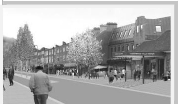
Joel Street - the way it should look at the end of the summer

To report anything to LBH Highways Dept. email contactcentre1@hillingdon.gov.uk Tel: 01895 556000