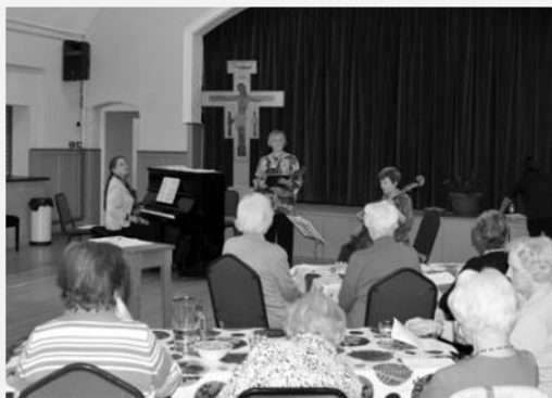
Our members enjoying a recent concert

Following our recent campaign to increase awareness of the Scheme, our membership has grown to 141. Membership is free, but we do make a small charge for activities to cover some of our costs. Some of our members are too frail to attend activities and many of these like to be visited by a befriender. Due to the increase in numbers, we are currently very short of befriending volunteers and would love to be able to match all those wishing for this service with someone suitable who would reduce their loneliness. If you feel this is something you might like to do, please get in touch. A few hours a week or even a fortnight is all the time needed. We are also always short of drivers to take our members