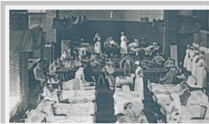
The new St John's Church converted to a VAD hospital, 1916

Anyone who has recently taken a walk down Hallowell Road in Northwood will have noticed that something has been happening at St John's United Reformed Church. In short, it has been a building site. But what exactly are they building and why? Well, the answer is that the church entrance area is being redeveloped to open up the space there and make the building more welcoming not only to the 1,000 or so people who make use of the facilities there every month, but to the community in general. Apart from the core United Reformed Church congregation, the church buildings are also home to a variety of clubs and societies from play groups to fitness and bridge clubs as well as being a place of worship for other Christians and a number of different faith groups.