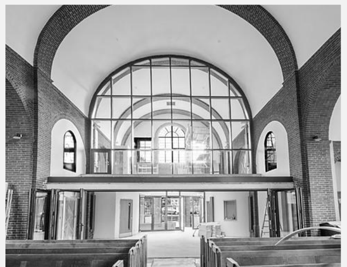
.... and afterwards