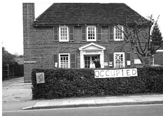
During the 1983 'work-in'

The Health Authority decided to carry out much needed repairs and alterations and the hospital was