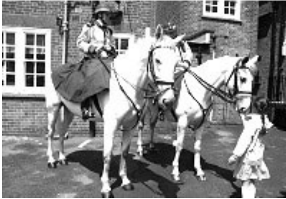
Police horses enjoy a snack.

On June 18th 2011, residents were able to tour Northwood Police Station as part of its 100th birthday celebrations. Lots of visitors enjoyed a nostalgic exhibition of police memorabilia including cars from the 1950s, 60s and 70s. It was good to see several former Northwood police officers there as well as two mounted police from Hammersmith and a dog-handling team.