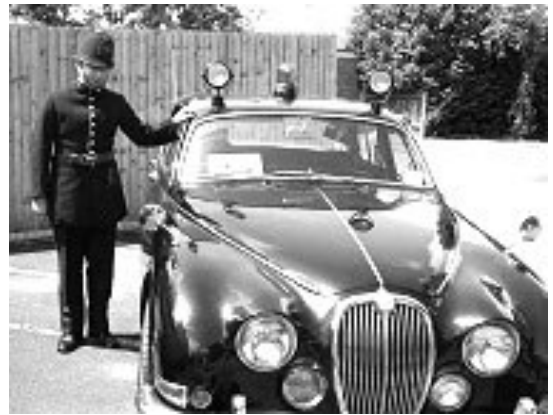
'Victorian' Pc admires a 1968 S-Type Jaguar which was formerly Metropolitan Police Area Traffic car Charlie One of West End Central.

Sorry, no report from the Northwood Safer Neighbourhoods Team this time. You can contact them on Tel: 020 8721 2545 or 07909 872377 email: northwood.snt@met.police.uk