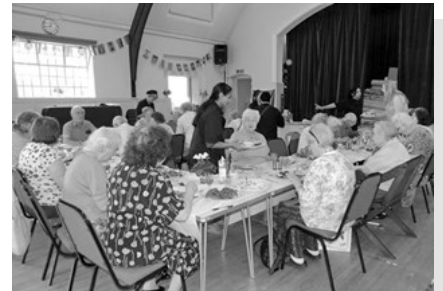
Celebrating the Queen's Coronation Jubilee

The Northwood Live At Home Scheme has a full programme planned for the rest of the year, helping older people locally to remain active and supporting them to stay living in their own homes. There are soup & sandwich lunches with speakers, gentle exercise sessions, the breakfast club, outings and shopping trips as well as the weekly lunch club. The Friendship Group at Northwood Hills URC