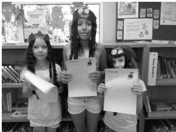
Summer holiday activities at the library

Northwood Library is pleased to announce that reading books is as popular as ever with the younger generation! Our Summer Reading Challenge exceeded all expectations with more children than ever visiting the library to take part. This year's theme was Mythical Maze and the library ran lots of fun events over the holidays including a Dragon Hunt, Face Painting, Mask-making, Story-telling and creative writing workshops, all of which were very popular. Thousands of books were borrowed, leaving some of our shelves quite bare in the children's section!