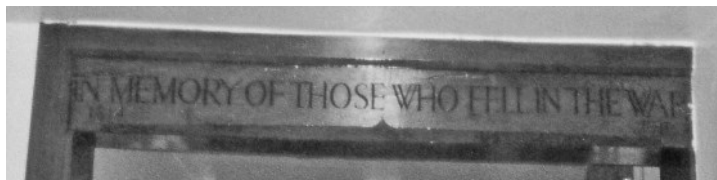
Memorial beam inside the Northwood & Pinner Cottage Hospital

As many of you will be aware we are facing redevelopment at the site of the old Northwood and Pinner Cottage Hospital. Many residents will know the proud story of this First World War memorial site, which was developed as a hospital by the community and effectively given to the NHS. It has been derelict for some years now while the NHS worked out what to do with it. Promises were made that it would be kept as a community health facility. Those promises are about to be broken. The Hillingdon Clinical Commissioning Group has declared it surplus to requirement while they make vague plans to develop a new "hub" of services at Mount Vernon.