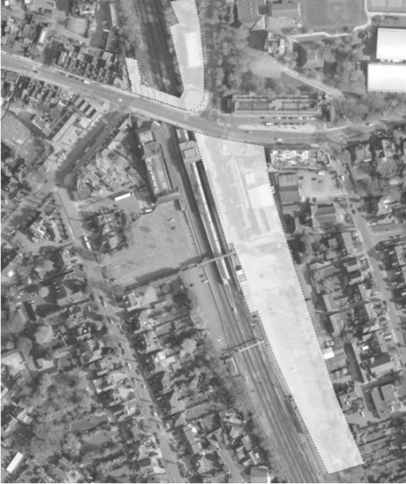
Aerial view showing TfL land holding on either side of Green Lane

TfL has been very pleased to see the progress of the Northwood Engagement process (Northwood Futures), along with an exemplary level and high numbers of response. In order to progress these discussions, as suggested by a number of engagement comments and discussed with the Northwood Residents' Association, TfL has begun the procurement of a consultant team to gather fundamental surveys, and information governing the site. It is expected that these consultants will be contracted shortly. This work will enhance and guide conversations with the community going forward, including, for example, the gathering of traffic surveys, making sure any counts fully represent all times of the day / week; structural considerations of the station and bridge, so as to better inform discussions as to step-free-access etc; and a review of planning policy, including the emerging policy plans.