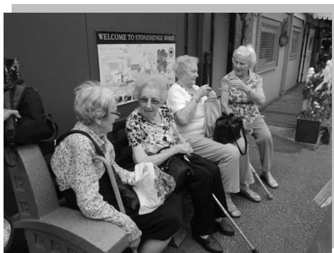
A Summer Outing to Leighton Buzzard Steam Railway