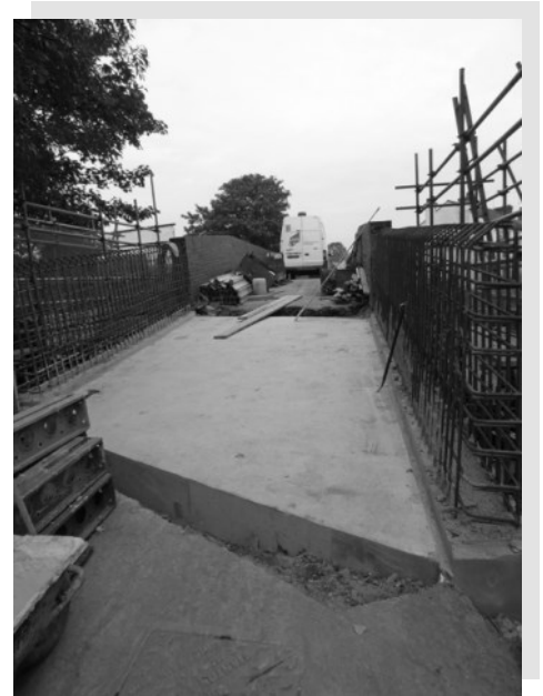
Highfield Road Bridge on 29th September 2014

The road has been closed to traffic and pedestrians since mid-August and work is continuing on a major refurbishment of the bridge. The project is scheduled to run for eight weeks, so should finish around mid-October.