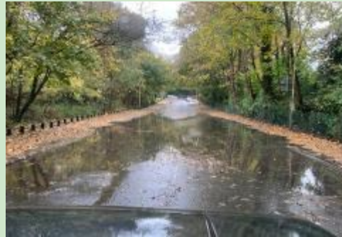
Copse Wood Way

At some point in time unless drainage infrastructure is increased in line with housing developments, drains that historically have been adequate, become inadequate. Likewise, if drains and their pipe networks become obstructed or are insufficiently / infrequently cleared, then debris build-up can develop and restrict flows.