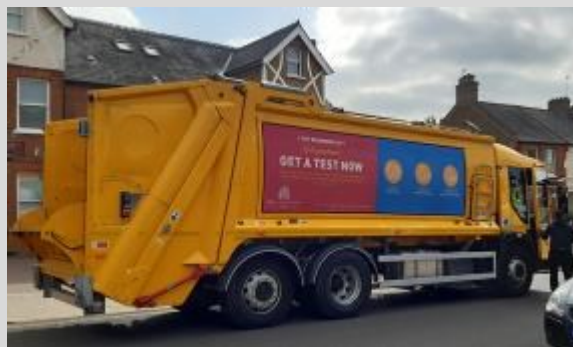
LBH, we value your services!

It is my pleasure to thank Hillingdon Council for their continued efficiency in running services throughout the pandemic. I'd also like to thank the many volunteers who have looked after the sick and elderly and also our councillors and MP.