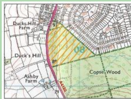
The newly purchased piece of woodland is shown by the orange shading

Other news is that the new refurbished Woodland Centre is opening at the Lido in July, which is well worth a visit.