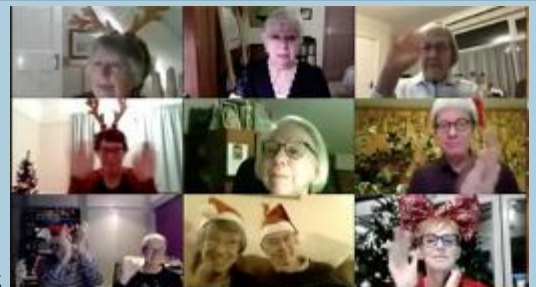
Members enjoyed singing Christmas carols and listening to Christmas readings, all accompanied by a glass of something and nibbles!