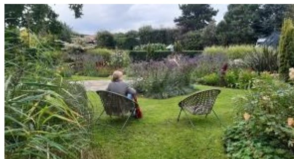
A return visit to Theobalds Farmhouse Garden is planned

We are planning a week's holiday 13th to 17th September. A variety of interesting gardens in the East Midlands, some privately owned, form the itinerary and we will be staying in a good hotel in the area. Interested? - please contact Paul Akers on 01923 821115 or send him an email to paul1945ginkgo@aol.co.uk