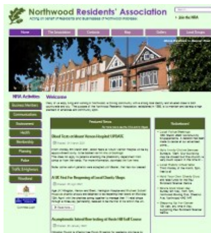
NRA website 2015 to 2021