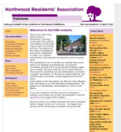
NRA website 2010 to 2015