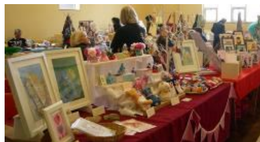
We hope to see you again soon!

Keep an eye on our website and social media pages for news of when we can open again.