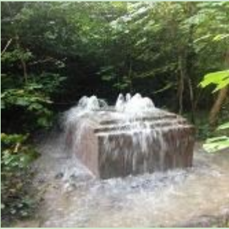
Northwood Gravel Pits

In the pictures serious flooding in Copse Wood Way and Hills Lane are highlighted. If drains block or become insufficient to deal with volumes of water above the design limit of the drain network, then flooding will occur. As single-family use housing is replaced by multiple family use dwelling units (such as flats, apartments and multigenerational large homes), and gardens are concreted or paved over for patios and car parking, sewage and foul/rainwater volumes entering drains increase. In addition, in our area there are local streams such as the Northbrook that over the years have been diverted into pipes and gullies, then to ditches, and typically find their way across two golf courses eventually exiting into the Lido. If any part of the streams network becomes blocked it can contribute to additional localised flooding.