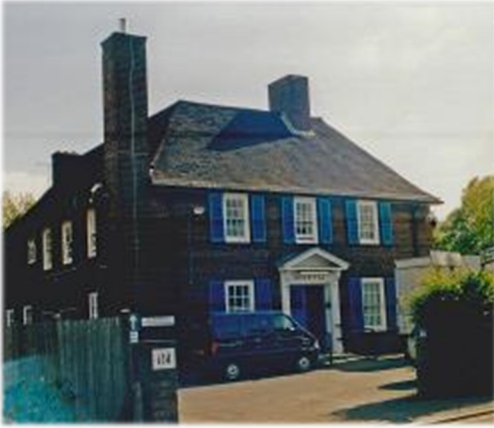
The Cottage Hospital still functioning in 2002

A planning application has now been submitted by the NHS for the reinstatement of the Cottage Hospital in Pinner Road, moving the Acre Way surgery into the Cottage Hospital together with the provision of other services to make the old building the North Hillingdon Health Hub, and then the construction of 70 flats on the remaining site.