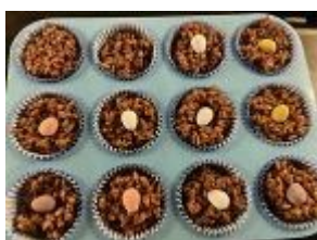
Cooking and crafts are popular online activities

Most Groups have been running online Zoom meetings for Beavers, Cubs, Scouts and Explorers, on the usual weekly basis. The range of ideas that our Leaders have come up with for these sessions has been truly amazing. Cooking has turned out to be by far the most popular activity among the young people taking part, they keep asking for more.