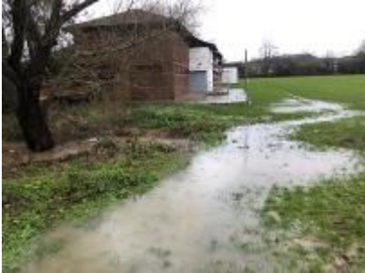
Definitely in need of TLC