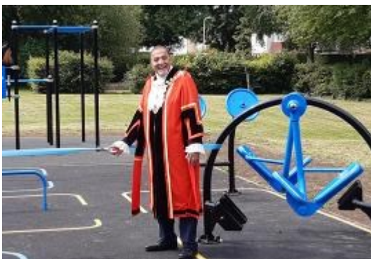
Official opening, 1st July 2021

She was invited to submit an application for Chrysalis funding and much to her delight, the application was successful.