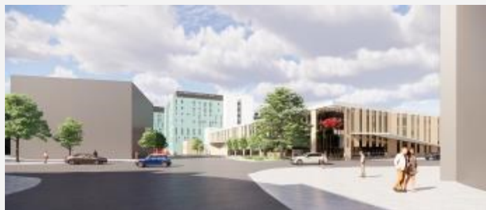
Artist's impression - Crispin Way

The Hillingdon Hospitals NHS Foundation Trust