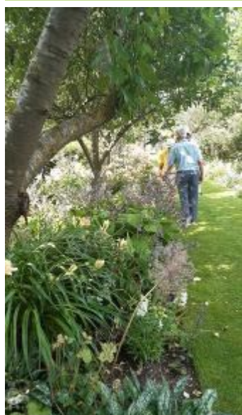
Visit to Theobalds Farmhouse Garden

With the country coming back to some sort of post-Covid normality, so the activities of the EASTBURY HORTICULTURAL SOCIETY have been picking up.