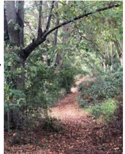
The Jubilee Walk, glorious once more