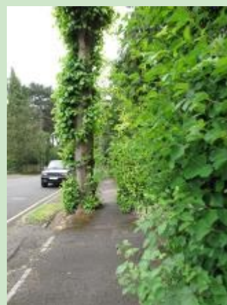
Consider the pedestrians

Plants, shrubs and trees have put on a growth spurt in the last month and gardeners may delight in this. That also has a by-product – trees and hedges that grow beyond boundaries and restrict pavements causing inconvenience to pedestrians. Can I make a plea to Northwood gardeners and to residents employing garden contractors? Please can you check your boundaries and cut back over-spilling foliage and hedges that reduce pavement width? Thank you.