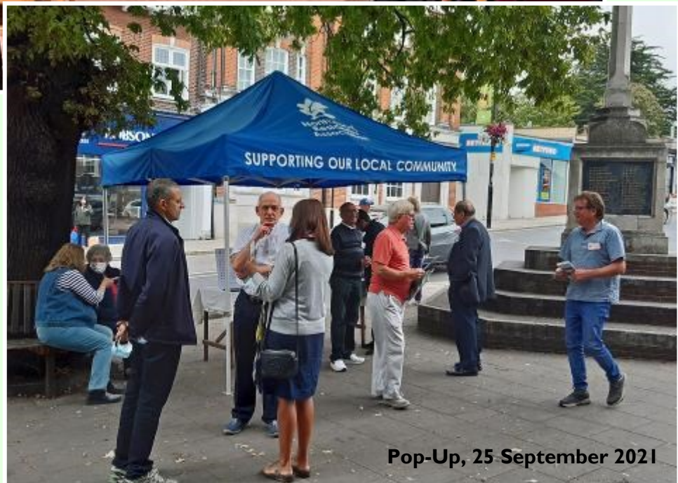
Pop-Up, 25 September 2021

The committee members are delighted to be meeting you face-to-face again