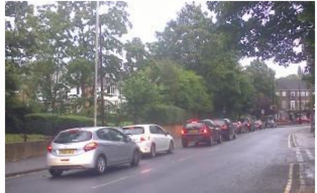
When will the chaos end?

At the same time there have been multiple daytime closures of Batchworth Lane in Hertfordshire with diversions set up using Green Lane from Rickmansworth Road to Watford Road causing long traffic jams. It seems odd that a