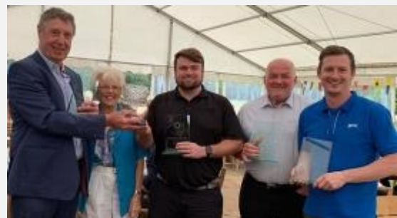
The Missing Links pictured with their awards and one of

Our 2022 Golf Day will be on, Tuesday 7 June . We had a great turnout this year and raised almost £6,000. Congratulations to Missing Links who won.