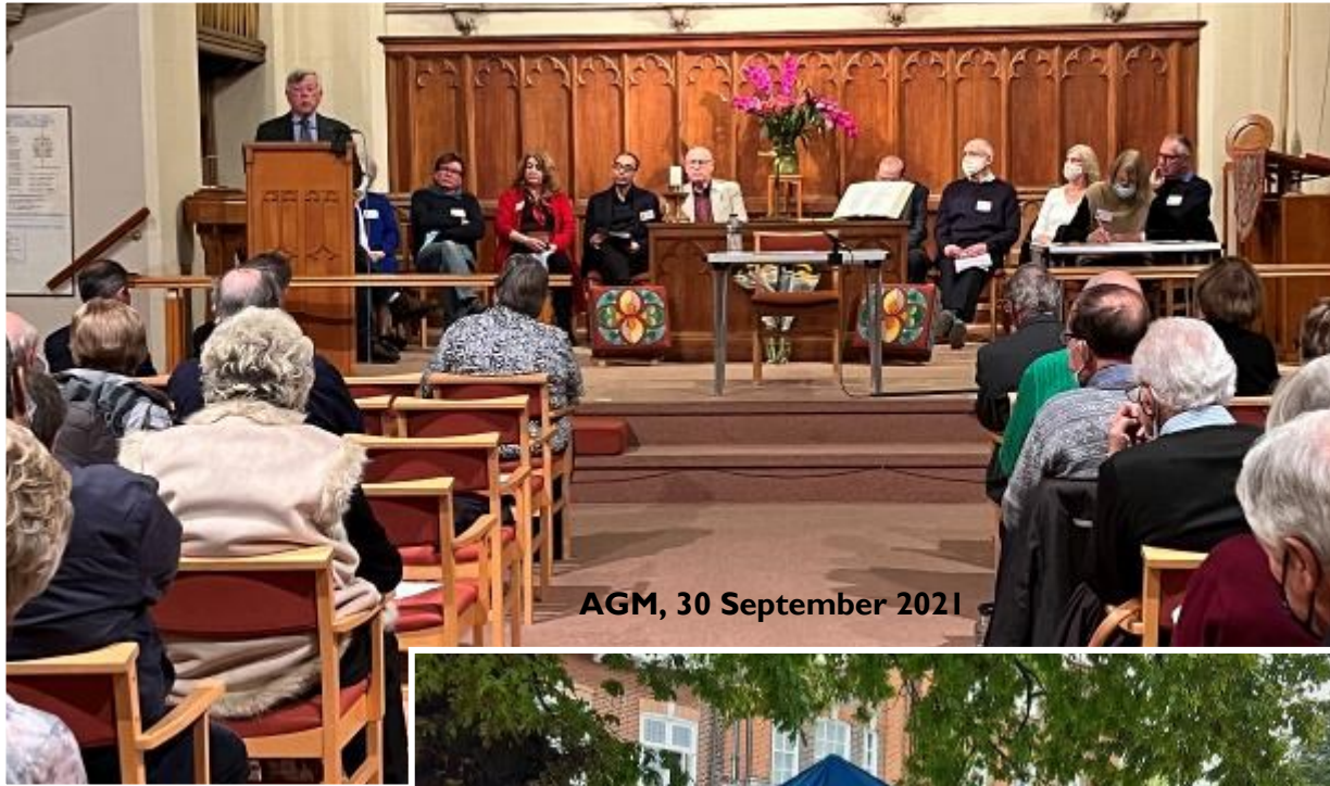
AGM, 30 September 2021