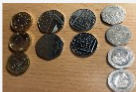
One £5 sub used 11 coins

To avoid unnecessary work in collecting the relatively small amounts involved written receipts will no longer be issued unless specifically requested. I trust you will understand this decision as sensible.