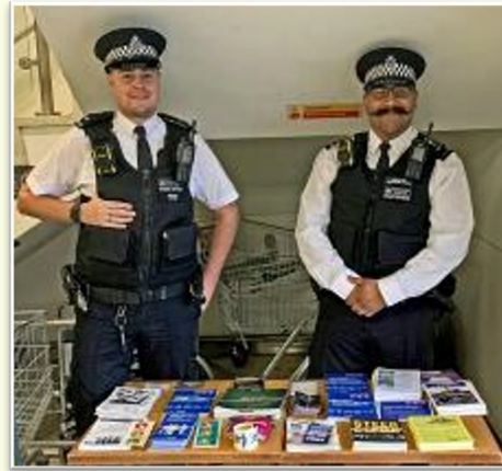
Northwood's finest man the Crime Prevention Stall