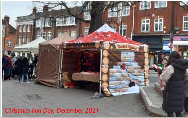
Christmas Fun Day, December 2021

Hillingdon Council. Its purpose was to create 'Welcome Back' events to town centres after the Covid-19 pandemic. Northwood had two events. One took place in Green Lane in mid-December with a Christmas retail theme that attracted mainly families.