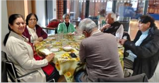
Some of our members enjoying the fortnightly soup, sandwich and samosa lunch

While the arrival of Omicron has curtailed some of our activities, by the time you read this everything should be up and running again. Northwood Hills Friendship Group and both seated exercise and yoga classes however have continued to meet safely face to face throughout. Our umbrella charity MHA's Digital Communities programme also offers a wide programme online to cater for all interests.