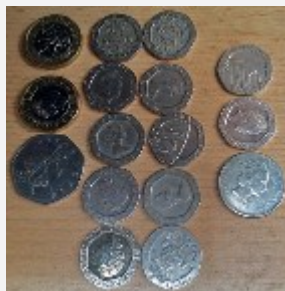
While this £5 sub used 16 coins!