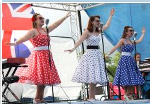
The Polka Dots - back by popular demand!