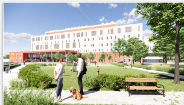
Artist's impression. Central Park looking towards the entrance

The HATS patient transport ambulance service will be able to collect and drop off patients as close to the main door as possible, next to the main entrance ramp.