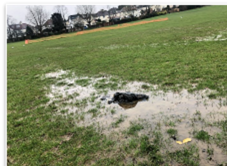
Definitely in need of investment

Hillingdon Council frequently tells residents how good their financial management is. Well, it's time to invoke those three important words - show don't tell. Our recreation ground is so vital for the mental and physical wellbeing of our community and is in dire need of investment to make it safe and usable all year round.