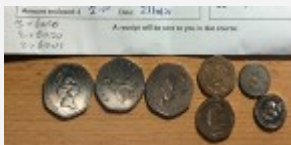
Recently, one £2 sub used 7 coins

Whilst on this subject, when using subscription envelopes please remember it creates much more work for your Road Steward (RS), for me or our treasurer if small denomination coins are used, as banks will accept coin deposits only when aggregated by like denomination to fixed totals in each bag.