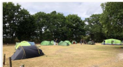
Outdoor activities still feature strongly in the Scouting programme

Website: www.6nscouts.org.uk Email: paul.catchpole@renscouts.org.uk Mob: 07392 996199