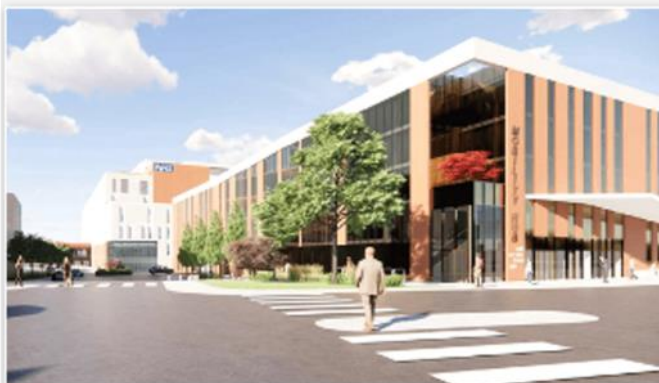
Artist's impression of the new hospital View of the main building from Pield Heath Road

While the council's decision is fantastic news, there is of course a great deal more work still to do – especially as we continue to develop our plans in more detail – so please do keep giving us your support and getting involved.