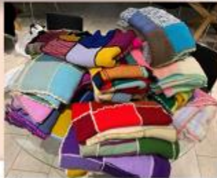
Best Wishes Guests and staff at Caritas Bakhita House January 2023

The guests are always overwhelmed when others care enough to make them something, that a stranger cares is very special to them. So thank you for thinking of us and giving your time to make our blankets.