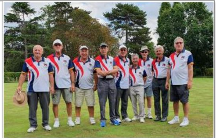
Members of the A team

Our OPEN DAY is on Sunday 14th May. Just turn up from 1pm to 5pm for a Free Taster session with one of our coaches. All you need are flat-soled shoes.