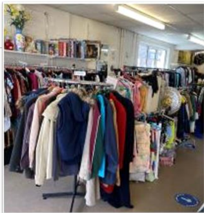
There are always plenty of bargains to be had at our 'Look-in' shop

The Mount Vernon Comforts Fund continues to provide vital equipment and facilities for departments on the Mount Vernon site for which all too often the NHS has no money. We have recently provided equipment for the children's hearing unit and the breast screening unit.