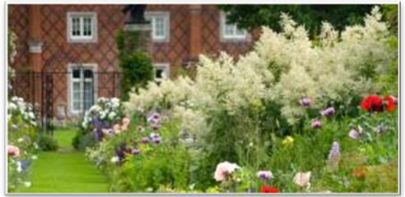
Helmington Hall Gardens – to be visited on our May holiday

Finally, we are pleased to announce that, having found an organiser for our shows, our Summer Show will take place on Saturday 1st July at Eastbury Farm School.