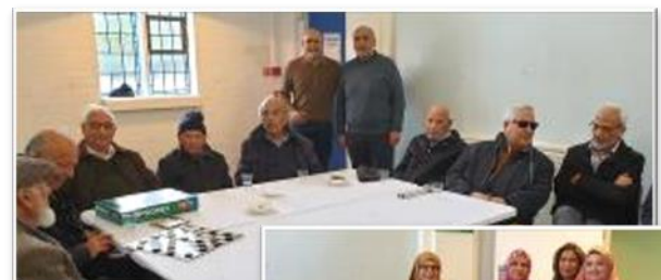
A recent coffee event held at Northwood Hills URC, Joel Street

It was noticeable at the event how grateful the elderly were to Iron Aid for restarting the meeting. We normally operate such activities through St John's Church Hall. That was flooded and needs extensive work to get it back into working order. We need to get back to the core community in Northwood as soon as possible and we in the Iron Aid Foundation are very clear this is the sort of activity that we want to develop into the wider Northwood community.