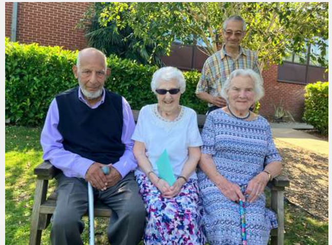
Friendship Group Members and a Volunteer relaxing after their Summer Picnic

For more information please contact the office.