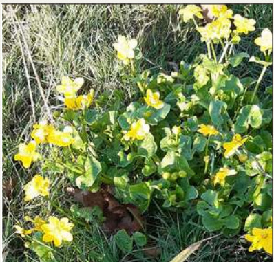
Marsh Marigold in the pond at the Recreation Ground