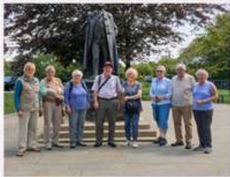
and the rambling group