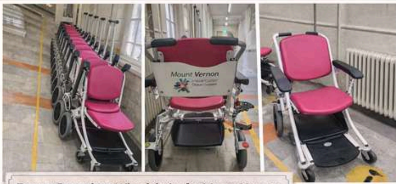
Recent Donation: Wheelchairs for Mount Vernon Cancer Centre