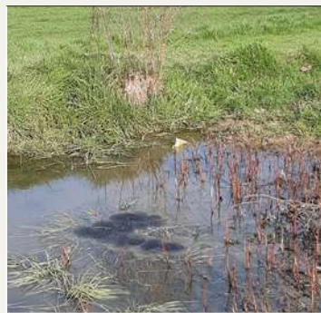
Frog spawn in the pond at the Recreation Ground