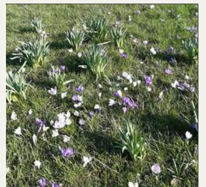
A carpet of crocus in the Recreation Ground